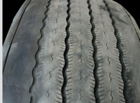
Shoulder Step Wear