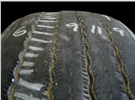
Depression Wear (Intermediate)