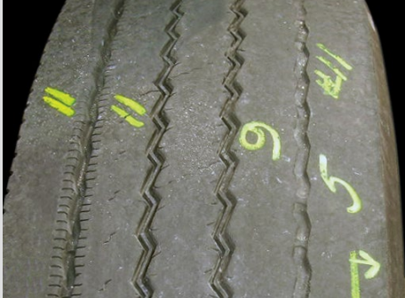
One Sided Wear