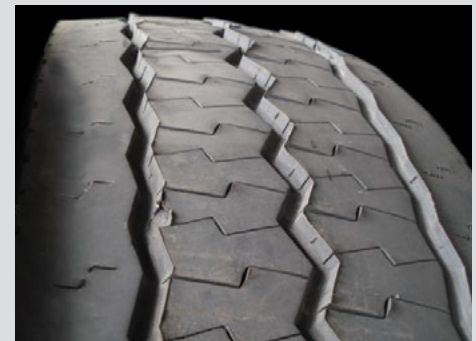
Radial Feather Wear